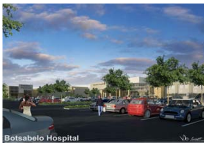
The new, state-of-the-art hospital will have 425 beds, 390 public and 35 private

The PPIP, including the Tšepong consortium, was carefully constructed to ensure progress and capacity building for the Basotho people. All of the key stakeholders involved with the PPIP, including the MOFDP, MOHSW, and Netcare, as well as the IFC which served as the Government's transaction advisor for the project, were committed to making the PPIP as integrated and far-reaching within the Lesotho context as possible. The PPIP's design has bolstered both community buy-in and political feasibility. As a result, the 18-year project will likely significantly impact Lesotho's economic development trajectory, in addition to making the country's health system more efficient and ultimately improving overall health outcomes.