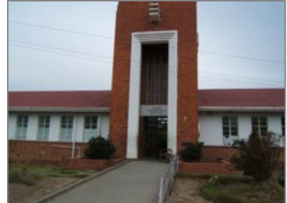
The 100-year old Queen II Hospital is to be replaced by a new facility

The term "PPIP" describes a particularly novel type of public-private partnership that combines private investment in public health infrastructure with long-term contracts for both clinical and non-clinical service provision. Lesotho's PPIP encompasses the design, construction, full maintenance, and full operation of the country's primary referral hospital and a new gateway clinic, and the refurbishment and re-equipping of three filter clinics (Mabote, Qaoling, and Likotsi) for 18 years. This form of PPIP can be referred to as a Design, Build, Operate, and Deliver